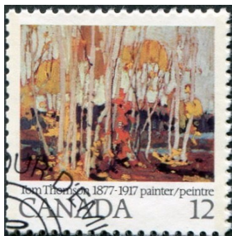
Tom Thompson's "Autumn Birches" (Scott 734)

Even though we did not have a great summer, we are certainly enjoying some great weather now. And soon the fall colours will be in their glory. (Yes, I know they are not quite the same in black and white, but here is a good excuse to visit our website and see these in colour).