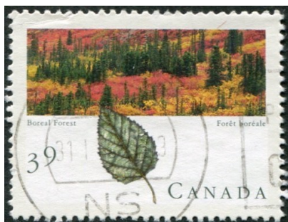
The Boreal Forest (Scott 1286)