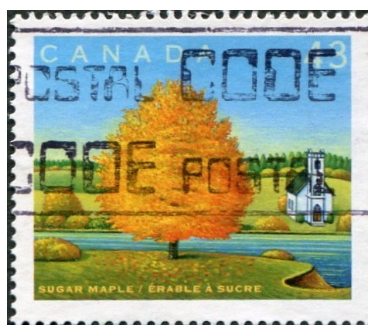
The Sugar Maple (Scott 1504b)